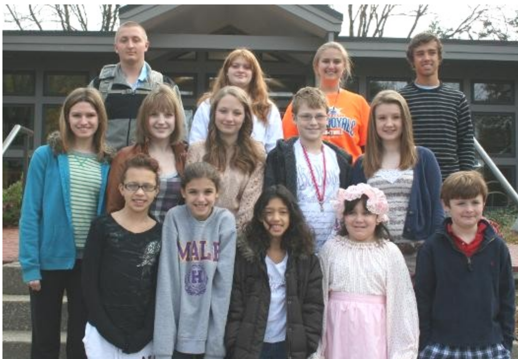
Members of the Kentucky Society, Children of the American Revolution