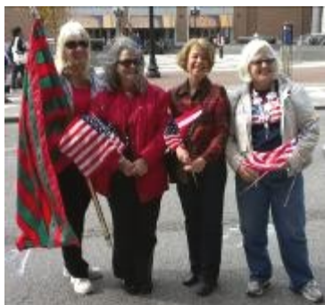
Corn Island DAR members