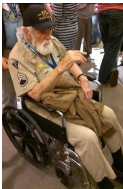
WWII Veterans coming through the reception line.