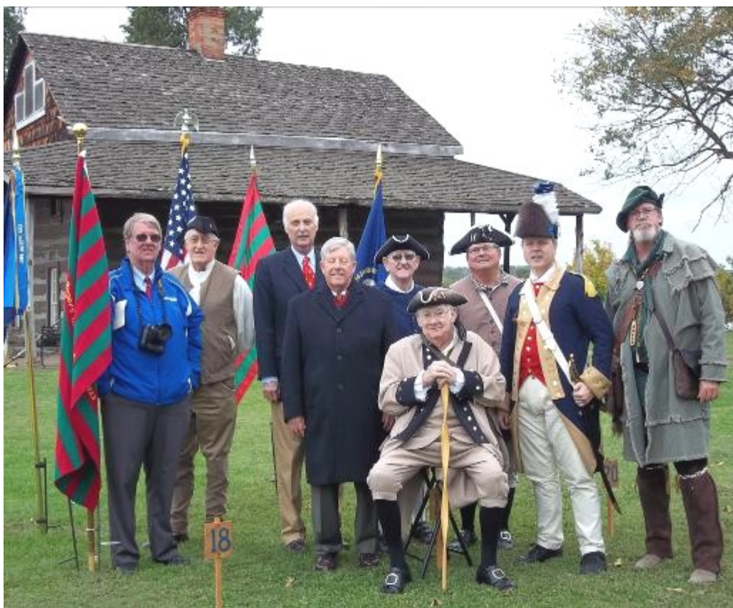
Members from three Kentucky SAR chapters attended the anniversary of the Battle of Point Pleasant: Big Sandy, Gov. Isaac Shelby and Lafayette.