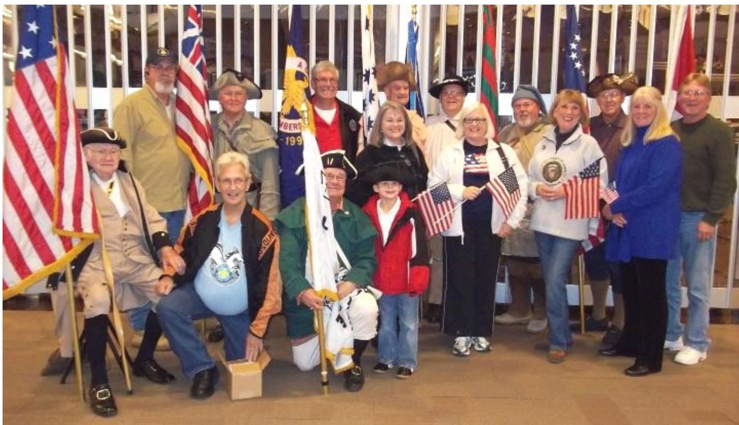
SAR & DAR members at recent Honor Flight