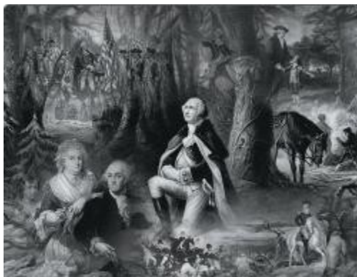
Several pictures of George Washington