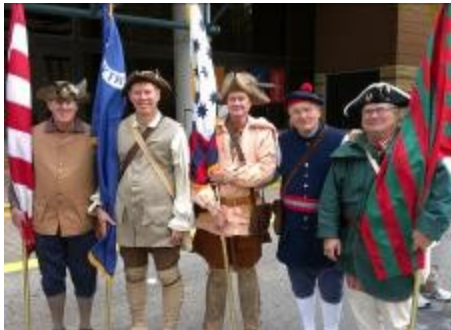
Gov. Isaac Shelby Color Guard