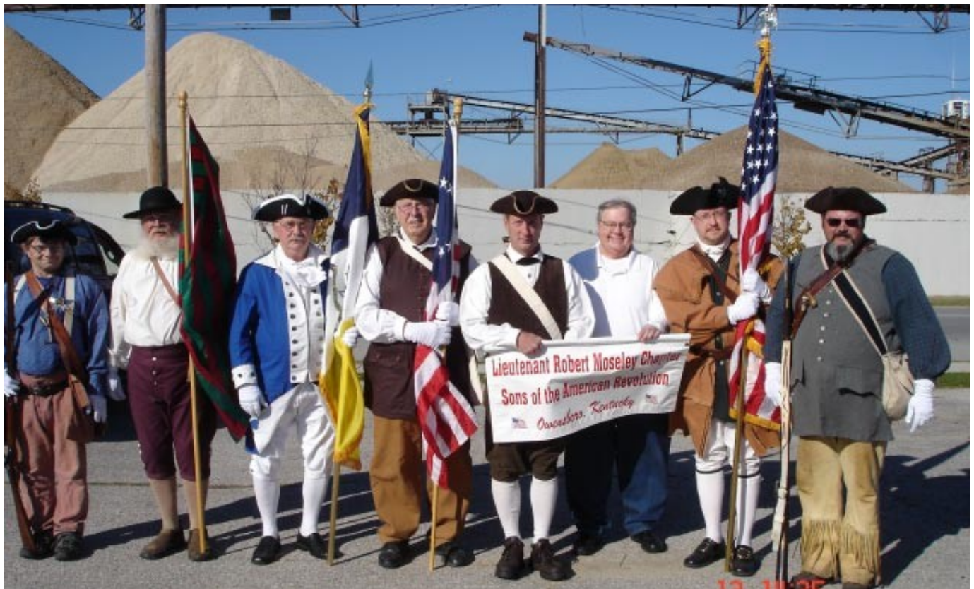
Members of the Lt. Robert Moseley Chapter and three members of the Ft. Hartford Muzzle Loaders marched in the 2012 Owensboro Veterans Day Parade.