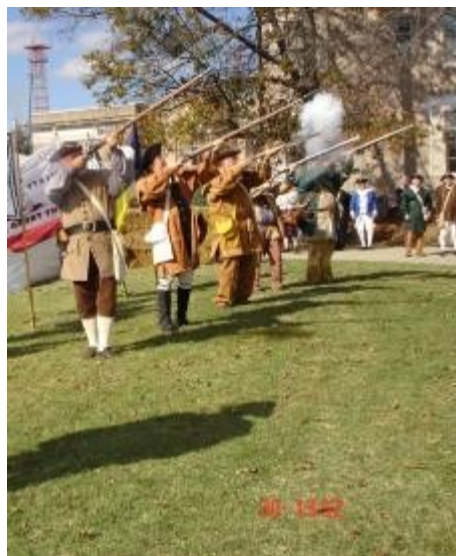
Black-powder gun salute.