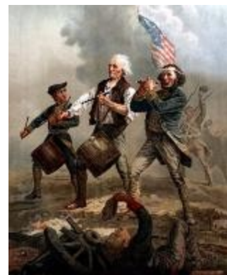
Spirit of 76