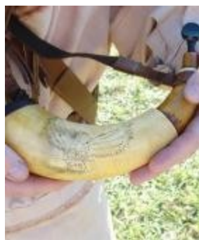
Powder horn with initials S.A.R.