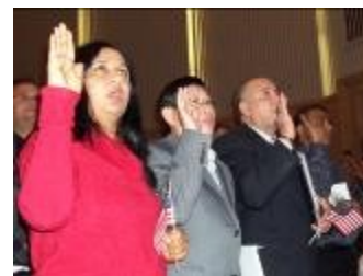
Applicants taking Oath of Allegiance.