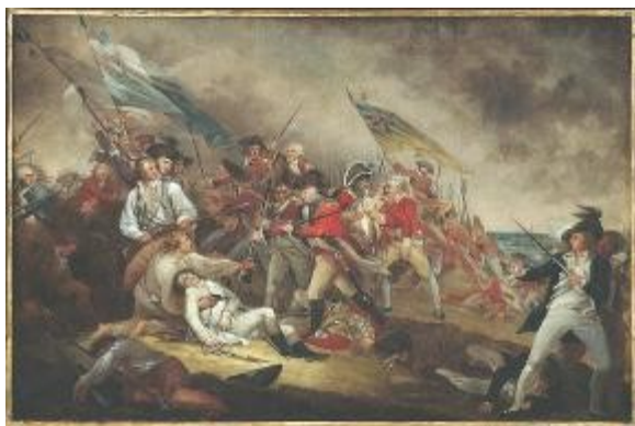
General Warren at Bunker Hill