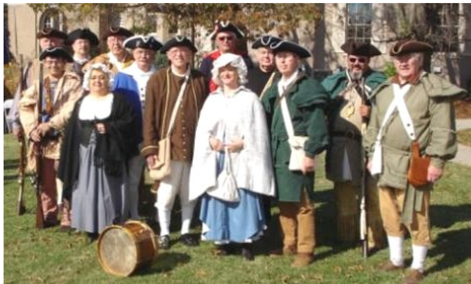
Members of the Lt. Robert Mosely Chapter, the Ohio Valley Chapter (Evansville) and the Fort Hartford Muzzle Loaders pose for a group picture.