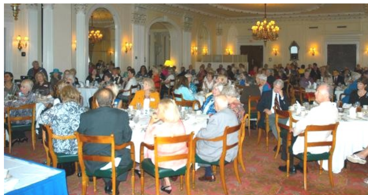
Packed house at joint SAR/DAR luncheon.