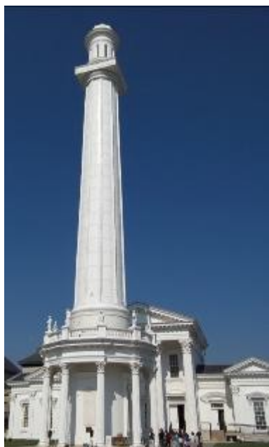
Louisville Water Tower