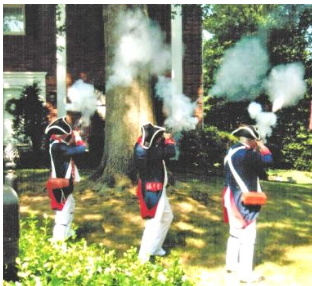
Color Guard members fire their muskets after parade in the Robinwood neighborhood of Louisville.