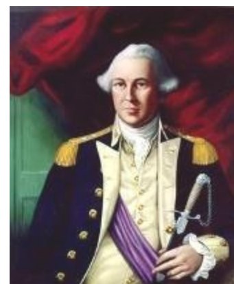
Major General Joseph Warren