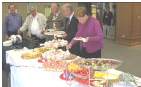
A nice reception was provided by the school.