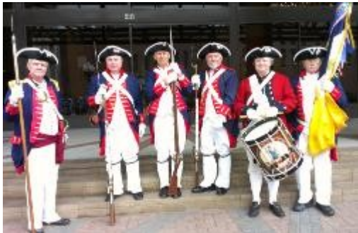
Louisville Thruston Color Guard