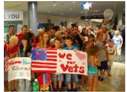
Group waiting for Veterans