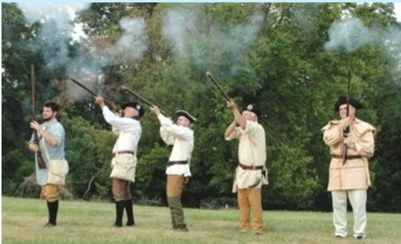
Black-powder gun salute by the Simon Kenton Chapter Daniel Boone Color Guard.