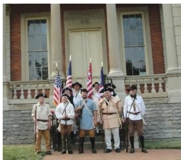
Simon Kenton Color Guard at the Cincinnati Observatory.