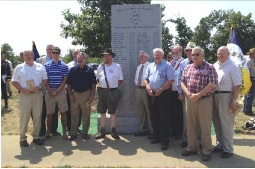
A dozen SAR members from KY, TN and IN gather after the dedication of the SAR monument to 71 Patriots was unveiled at the KY Veterans' Cemetery West at Hopkinsville, KY. More than 200 attended the monument unveiling.