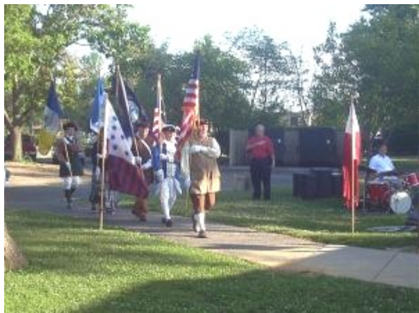
Lt. Robert Moseley Color Guard presenting Colors and standards at their Flag Day picnic.