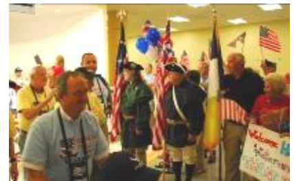
Veterans returning from trip to Washington D.C. to visit war memorials.