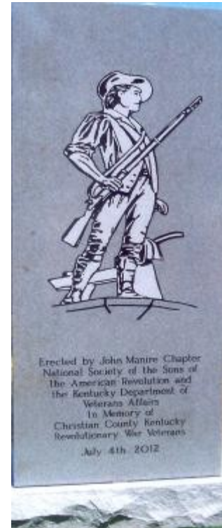
Monument erected by the John Manire Chapter to honor Christian County, Kentucky Revolutionary War Veterans.