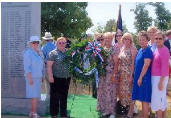
Members of the Colonel John Green Chapter, KSDAR