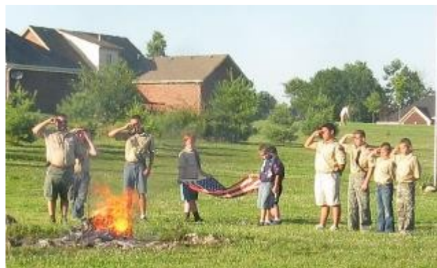
Boy Scouts salute while retiring several flags.