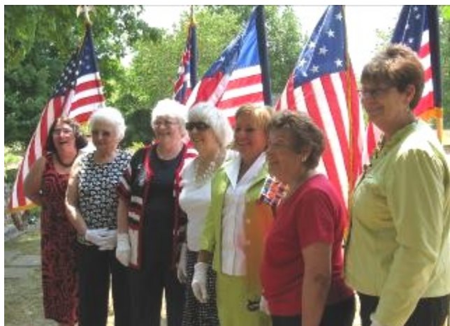
Members of the Captain Jacob Van Meter DAR Chapter