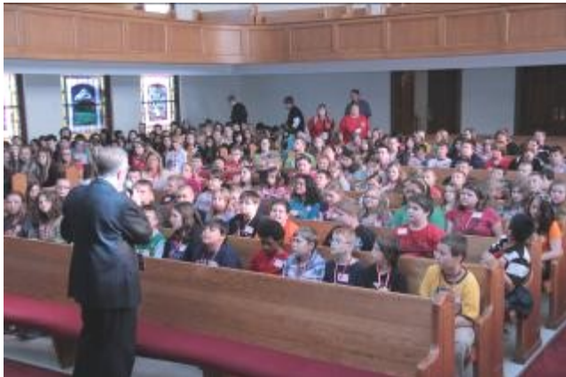
Students at CAAH session in Williamsburg, KY

The Capt. Charles Gatliff Chapter of the Sons of the American Revolution met May 14 th at the Hutton School of Business located on the campus of the University of the Cumberland. Following the opening ceremony and invocation, dinner was served.