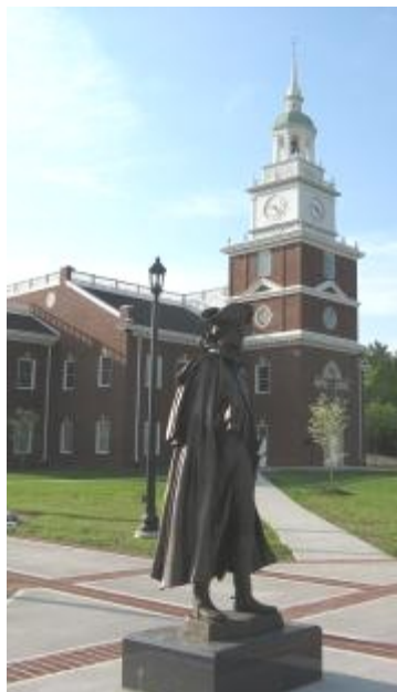
A George Washington monument on the campus of the College of the Cumberlands