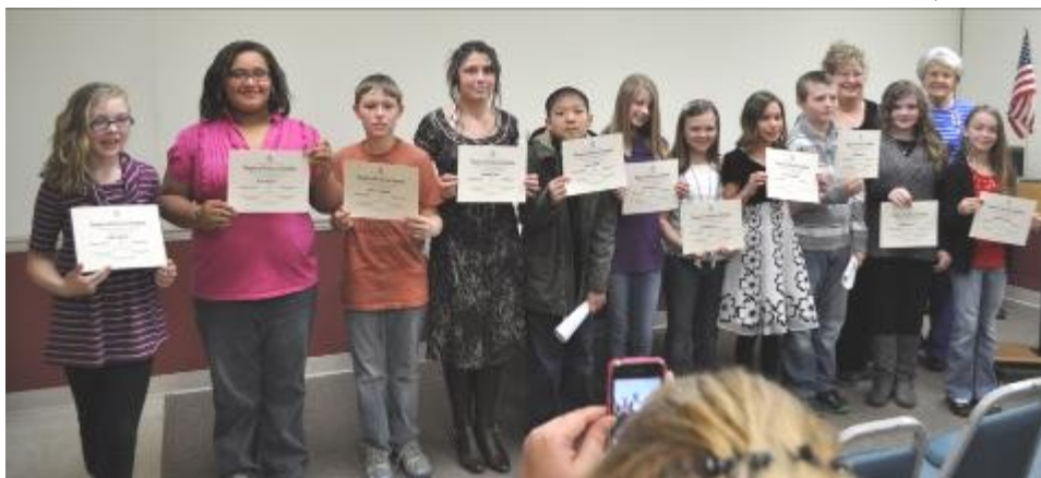
The top 12 students read their essays to the group. Participation certificates and dollar coins were awarded to each of the winners.