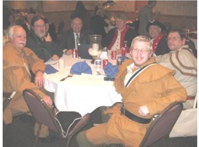
Seven of the seventeen Simon Kenton Chapter members who attended the KYSSAR state meeting in Erlanger, KY.