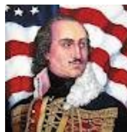
Count Casimir Pulaski