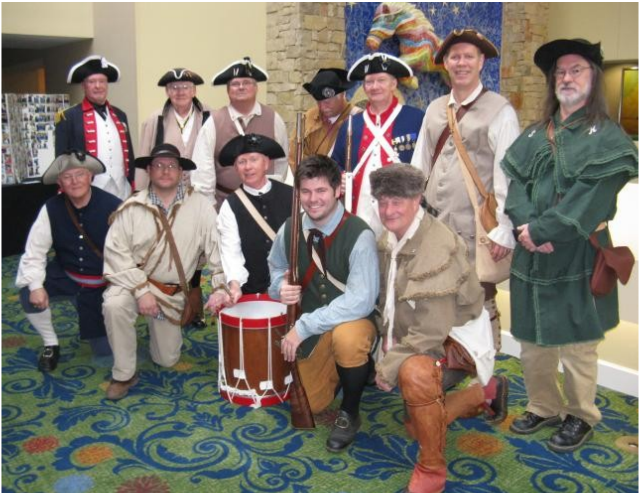
Kentucky Color Guard Members at Kentucky DAR State Conference

Turning point of Revolutionary War in the South.