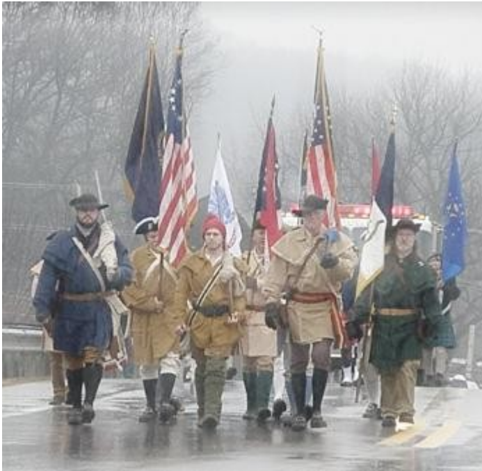
Members of the Daniel Boone Color Guard of the Simon Kenton Chapter march to Harrison's Tomb.