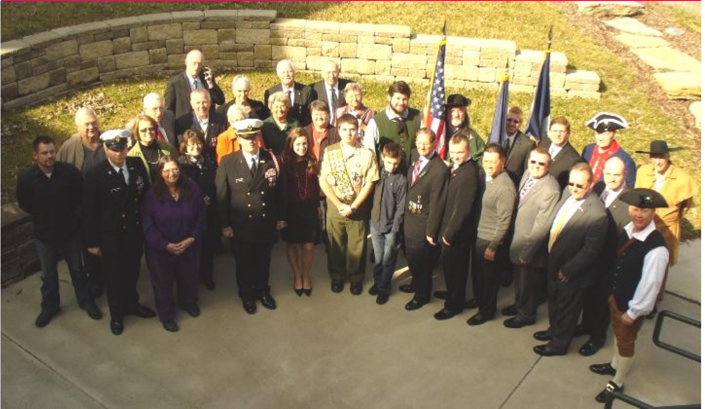
Group pictures of those who attended the Simon Kenton Chapter's Presidents' Day Luncheon.