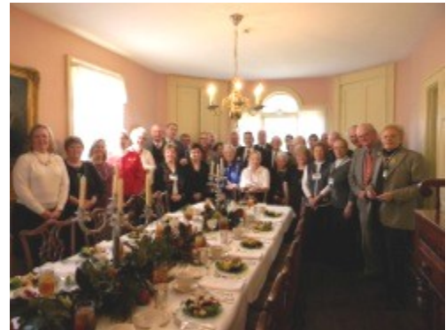
Lafayette Members and Guests at Duncan Tavern