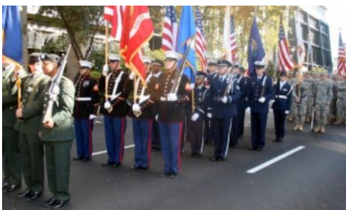
U.S. Military and old army truck.