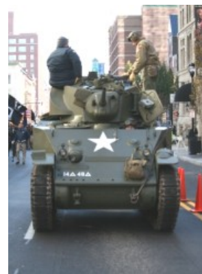
World War I tank