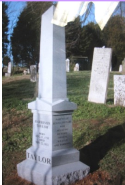
Harrison Taylor Monument