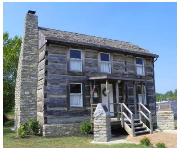
Captain William Arnold House, Williamstown, KY