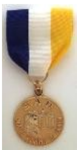
Martha Washington Medal