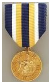
SAR medal of Appreciation