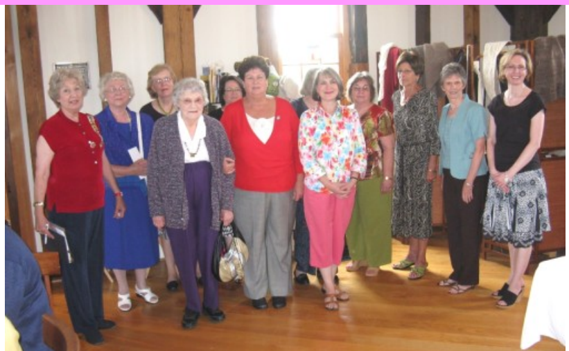
Members of the Isaac Shelby DAR Chapter at joint Bland Ballard/Isaac Shelby DAR Flag Day luncheon.