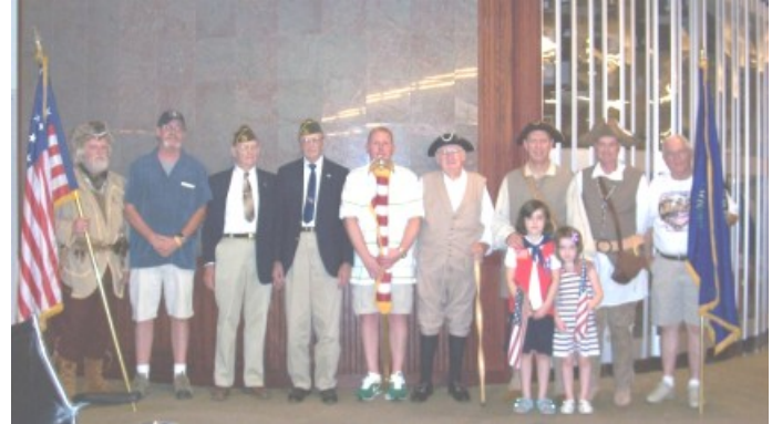
World War II Veterans are welcomed home after visiting WWII Memorial in Washington DC.