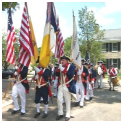
Louisville Thruston Chapter's Color Guard at Memorial Day Service.