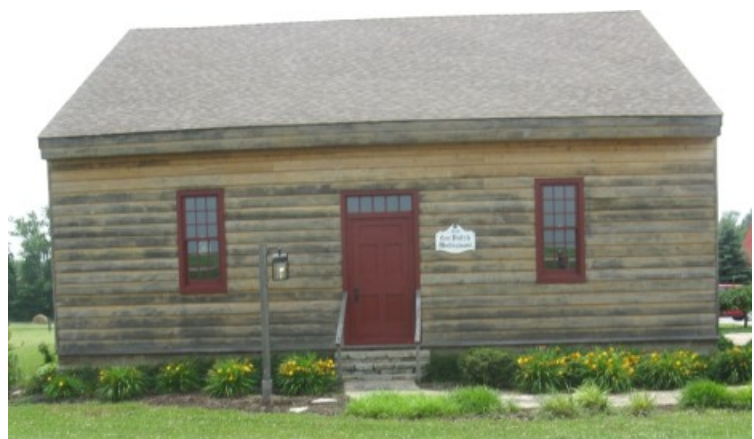
Low-Dutch Meeting House—Pleasureville, KY c1821 Site of Isaac Shelby DAR/ Bland Ballard DAR Flag Day Luncheon