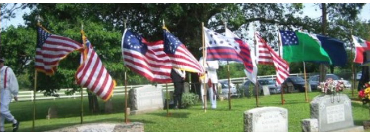
About half of the flags at the Patriot Grave Marking service.