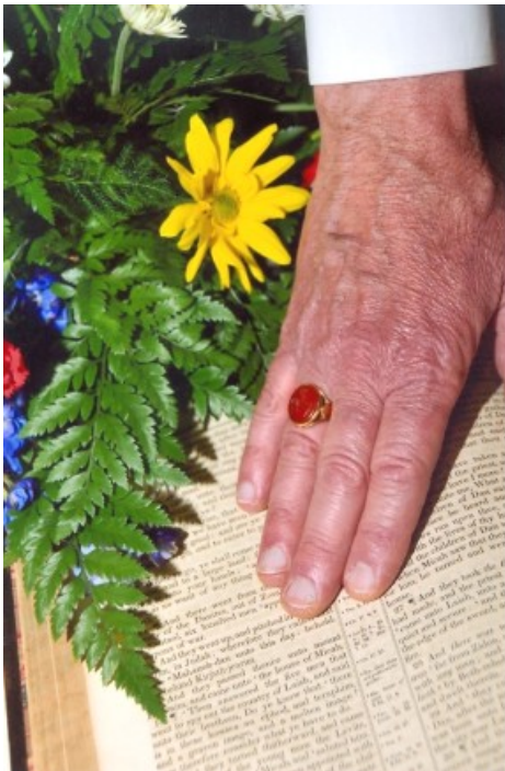
A Revolutionary War era Bible was used during the swearing in process.